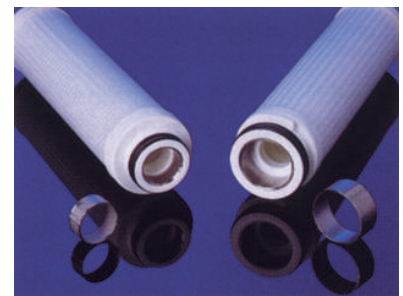
Stainless Steel Inserts

Efficiency, flow capability and service life are similar for all available constructions.