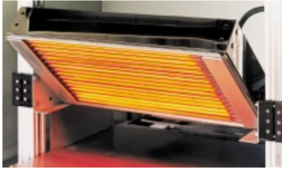
Carbon IR emitter array testing in the Application Centre at Heraeus Noblelight

Dimensions: 75 cm x 50 cm Power Rating: 30 kW Power density: 70 kW/m 2